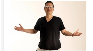
Aspiring models - here's your chance to be a muse for the artists at The Straits Times.

Make green pledge and be a winner at Star carnival To celebrate The Straits Times' 167th birthday, electronics giant Panasonic will be giving out 167 prizes in a lucky draw at the Straits Times Appreciates Readers (Star) carnival next Sunday.